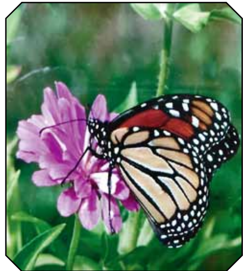
Mature Monarch butterfly

It was my good fortune to meet with them on the day a butterfly hatched from its chrysalis. We watched as it gently spread its wings to dry. Eventually it moved from the chrysalis and was able to fly. Carol gently removed the butterfly and we proceeded to their front garden where she gently transferred the butterfly to me and allowed me the privilege of releasing it.