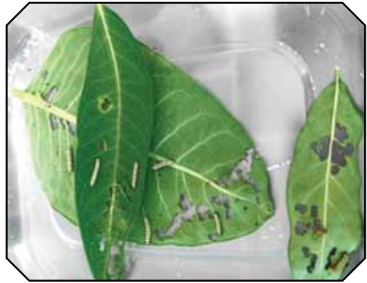
Larva stage on milkweed leaf

After spotting the eggs, they remove the leaves with eggs to a container until the caterpillars appear. They then move them to a butterfly cage where they eat voraciously and grow. As they grow larger, they move to the top of the cage – an indicator they are ready to form a chrysalis. Inside the chrysalis (cocoon) is where metamorphosis occurs and a butterfly emerges. This process can take from 5 to 21 days, which may vary with different species.