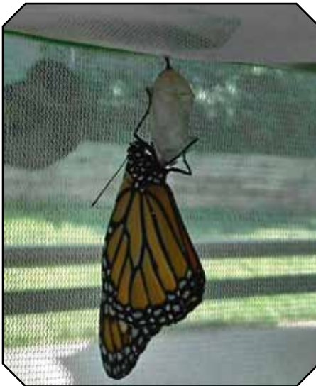
Hatched butterfly drying wings

After spotting the eggs, they remove the leaves with eggs to a container until the caterpillars appear. They then move them to a butterfly cage where they eat voraciously and grow. As they grow larger, they move to the top of the cage – an indicator they are ready to form a chrysalis. Inside the chrysalis (cocoon) is where metamorphosis occurs and a butterfly emerges. This process can take from 5 to 21 days, which may vary with different species.